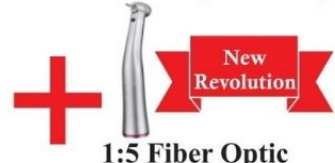
1:5 Fiber Optic Handpiece